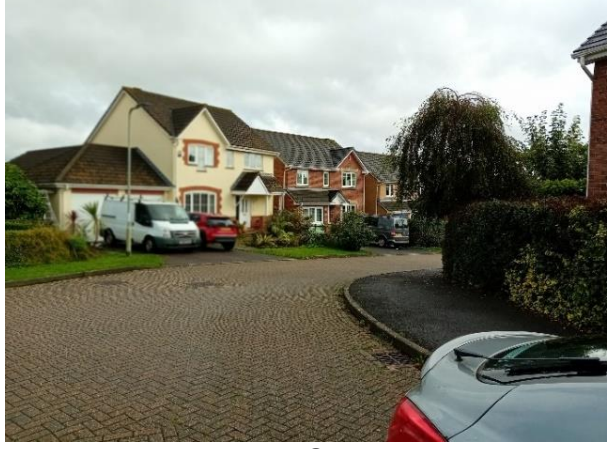
Figure 1. Application Site.

The application site is a 2 storey dwellinghouse with attached double garage. The property has a red brick plinth, cream rendered walls and a tiled roof. There is a double driveway to the west or front of the dwelling together with small open garden and entrance porch and an enclosed garden at the rear.