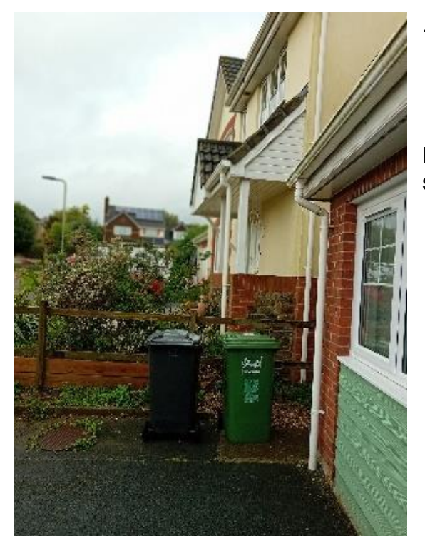
Figure 3. Existing porch viewed from the south.