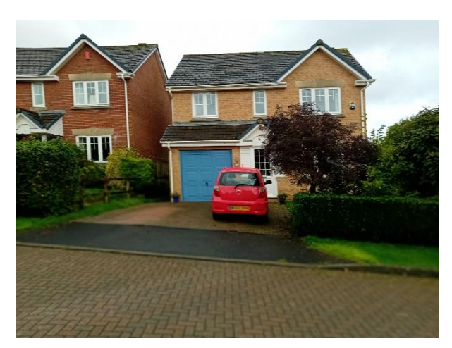
Figure 2. Neighbours Opposite