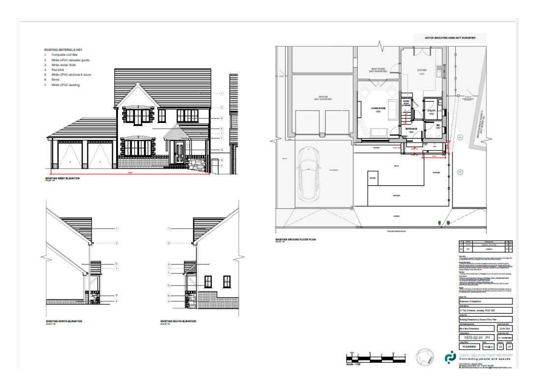
Figure 6. Existing Elevations.