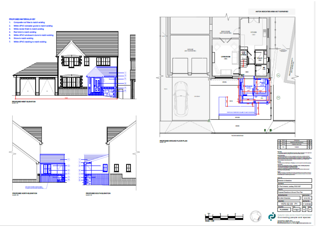
Existing 7. Proposed Elevations.